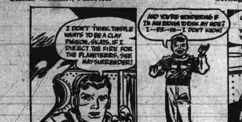
Time To Move