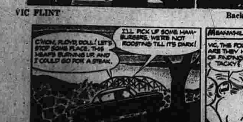
Lily Can't Take It