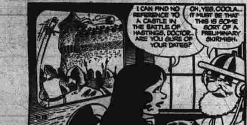
THE WORRY WARR