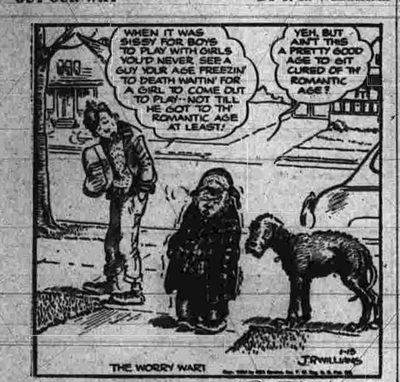
OUR OUT WAY