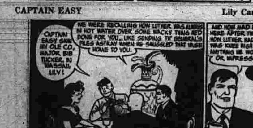
The Double Life